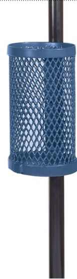
LR360(D) ▶ (Pole not included)